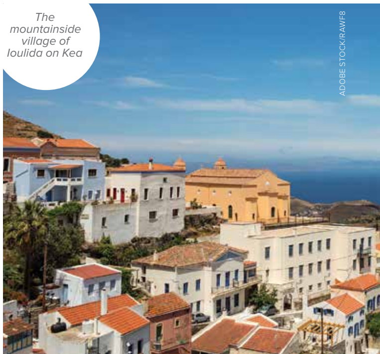
The mountainside village of Ioulida on Kea

Here, the islands and days flow by and too soon, it's time to head back north, so we scour the charts to find one more island before returning to Athens. We settle on Kea, which turns out to be a great find. A weekend destination for Athenian yachties, Kea is often overlooked by charter boats and that's a mistake. The island benefits from frequent rainfall (by Greek standards) so it's more verdant than the rest of the Cyclades and is covered by row upon row of olive tree terraces and beautiful vineyards; the countryside is more akin to Italy. Like most villages in the Cyclades, Kea's town of Ioulida is built into a mountainside and practically