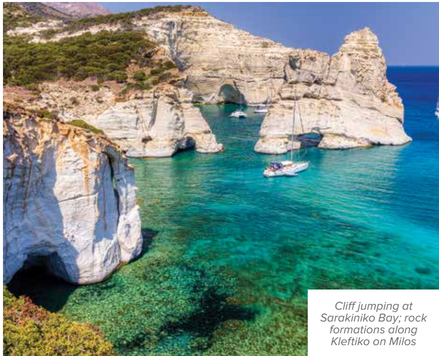
Cliff jumping at Sarakiniko Bay; rock formations along Kleftiko on Milos

archeological dig. There are no tavernas, no discos, no shops, and most important, no anchoring, which is why you take a ferry.