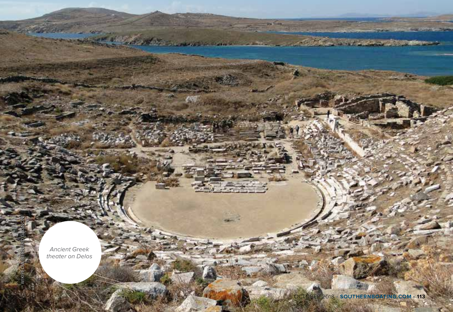
Ancient Greek theater on Delos

The Meltemi wasn't letting up so we book ferry tickets to Delos, the neighboring island, all of which is an active